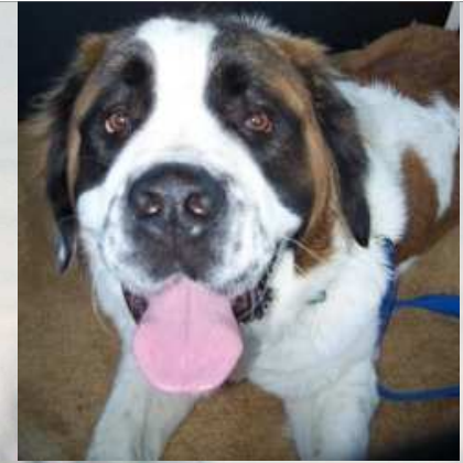
My Dog Fluffy

Hope to Participate in Medieval re- enactment